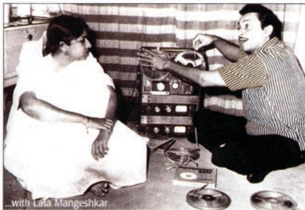
...with Lata Mangeshkar